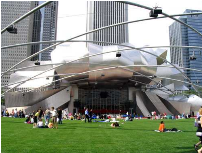
Frank Gehry, Pritzker Pavillion, Millennium Park, Chicago.