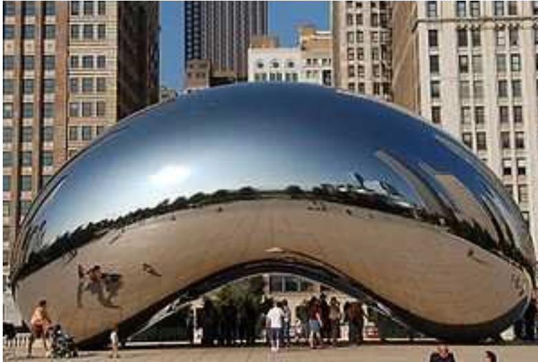
Anish Kapoor, Cloud Gate, 2004-2006, Steel, Height 33', Length 66', Width 42', Millennium Park, Chicago.