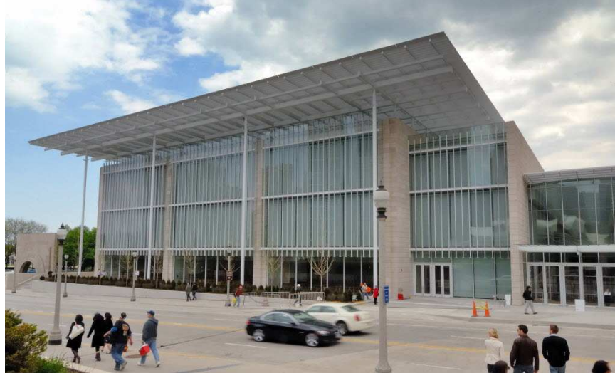
Renzo Piano, Art Institute of Chicago Modern Wing, 2009.